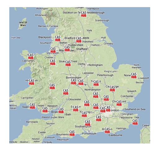
Figure 2: The CAS Hubs in England and Wales.

In addition to these distributed communication mechanisms, CAS aimed very early on to facilitate face-to-face contact between teachers. This is most feasible where teachers are geographically close, and is supported by CAS Hubs.