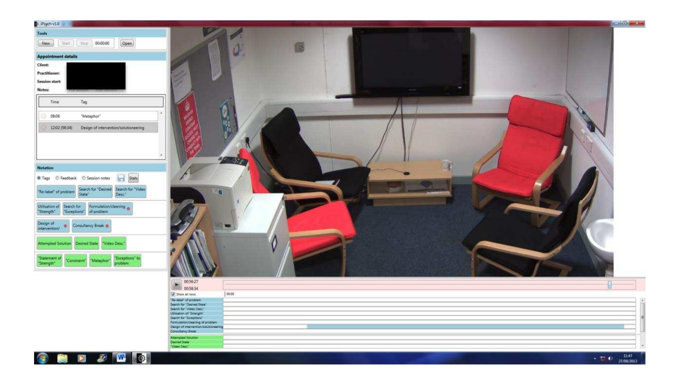
Figure 2. A screenshot of the iPsych software.