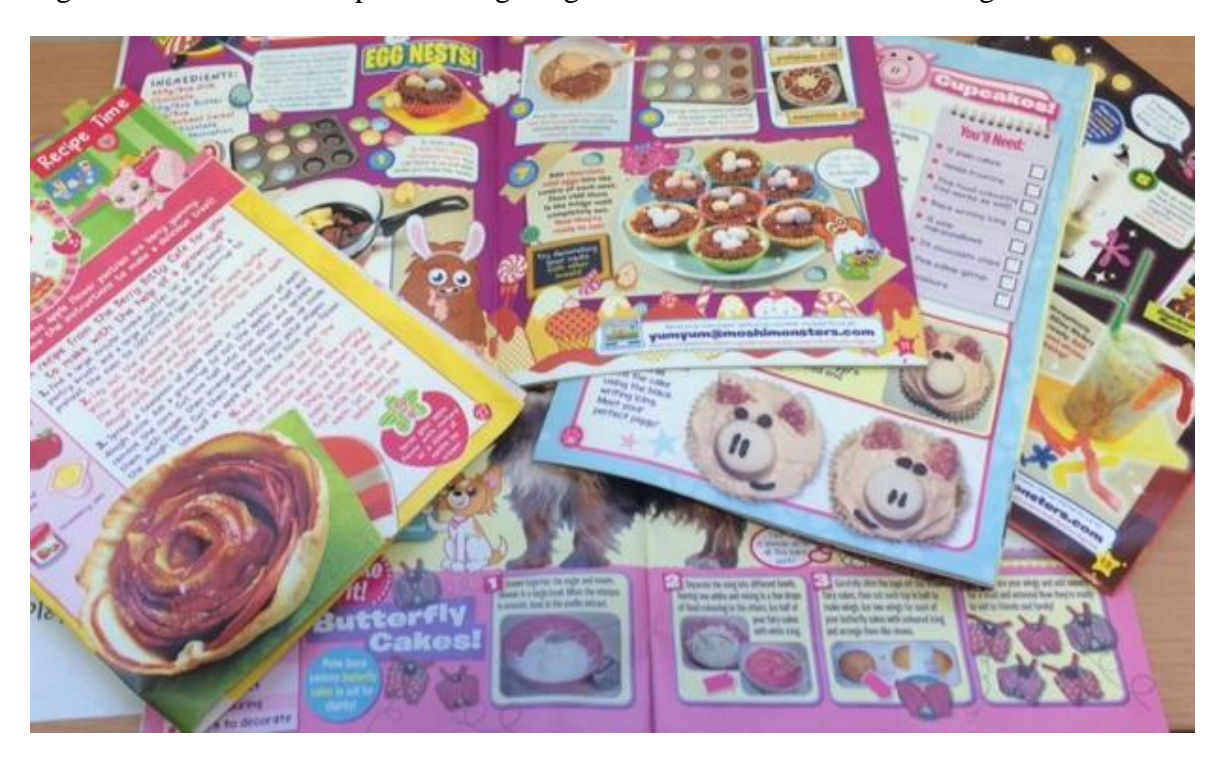
Figure 1 Selection of recipes with high sugar content sourced from the magazines