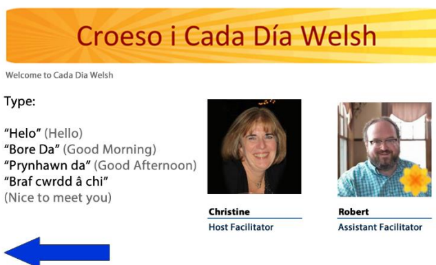
Figure 2. Cada Dia Welsh template slide, illustrating the use of helper text during the web meetings, and question prompts for meeting participants.