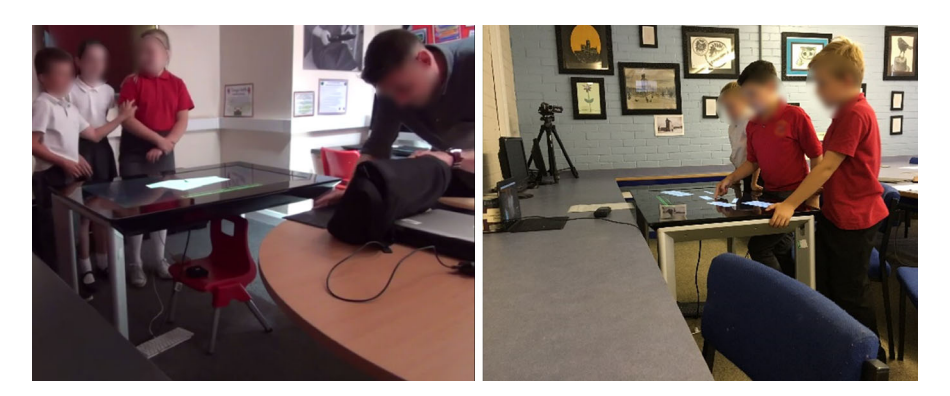
Fig. 1 Groups from school 1 and school 2 facing each other via Skype