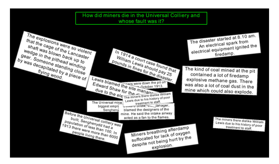
Fig. 2 The SynergyNet Mysteries app with task content used in our trial