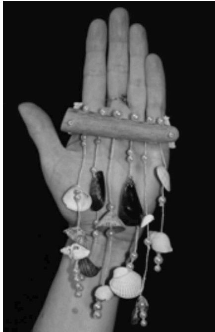
Figure 4. Fidget jewellery

second live lab by singing seaside related songs and rhymes. For several minutes they were observed to be communicating and were intimately connected via interaction with the object.