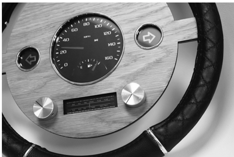
Figure 3. Steering wheel

On the first live lab evaluation the resident was recovering from surgery and reticent to hold the wheel or bring it close to his body. However, he did show interest in the object and was observed by the research team to become less agitated and stressed. On the second Live Lab evaluation day the resident's health was still very poor. Despite being told initially he was too unwell to participate, carers wheeled him through to the lounge area in a wheelchair with him holding the steering wheel as if he was in control of his vehicle. There followed a very playful session lasting about 20 minutes when two carers sat next to his wheelchair and play-acted a road trip to the seaside to buy ice cream. This included driving around bendy roads, parking the car, tuning-in the radio and driving home. The research team observed and noted the participant's body language and facial expressions and it was clear to all he was having a very good time. The care home manager reflected on this activity saying: 'We had a very personal journey, on a trip and he was driving us to Porthcawl. It was absolutely the most interaction I have ever seen from him. It was absolutely amazing... it was!' The steering wheel has been used subsequently by the resident and carers and has continued to bring him pleasure.