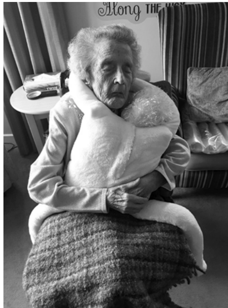
Figure 2. Hug

When the participant was first given ‘Hug’ she responded positively by holding it close, resting her head on it and closing her eyes as well as speaking a few words, to the amazement of the care staff. When the research team left and the resident returned to the dementia unit, her carer observed that she continued to hold it close and that when staff tried to remove it from her she cried and wanted it back. Three further live lab evaluation sessions (over a period of two months) in which the participant’s facial expressions and body language were observed, confirm that she experienced comfort and pleasure from ‘Hug’. The care professionals have provided further confirmation of this and report that her overall health has improved, falls have reduced, her appetite has returned and that she now speaks a little and socialises with other residents. Her carer confirmed this saying: